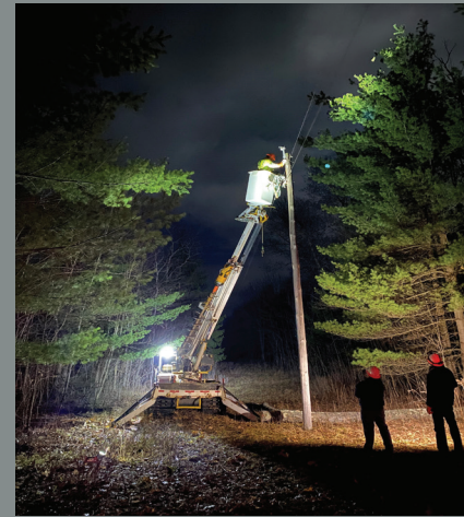
Wind Storm Friday, March 26, 2021 Bath District