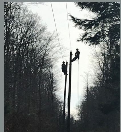
Outage, Cherry Creek District